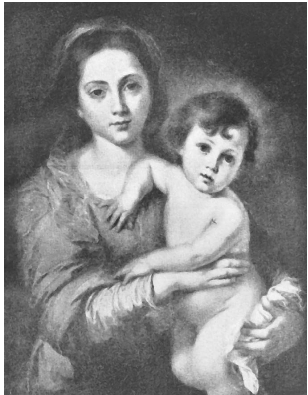
Madonna and Child, by Bartolomé Murillo, 1617-1682

Why did the second person of the Trinity assume human nature? It was 1) to save all men and women from their sins and to reconcile them to God (see 1 Jn 4:10,14); 2) so that all men and women will know God’s love (see Jn 3:16); 3) to model holiness and the